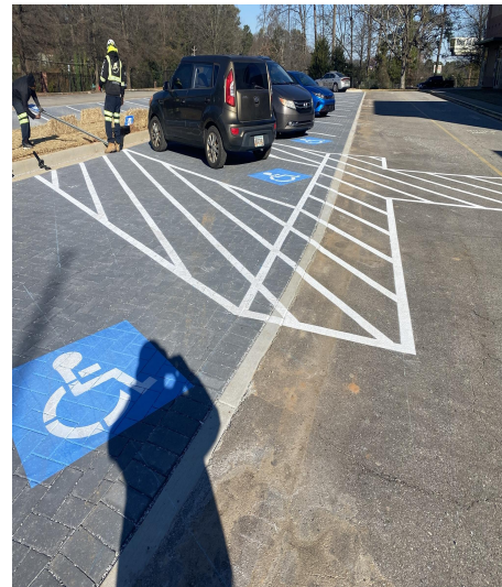
Handicap signage being installed in Phase 1 parking area.