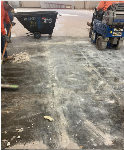
Demolishing flooring in cafeteria area.