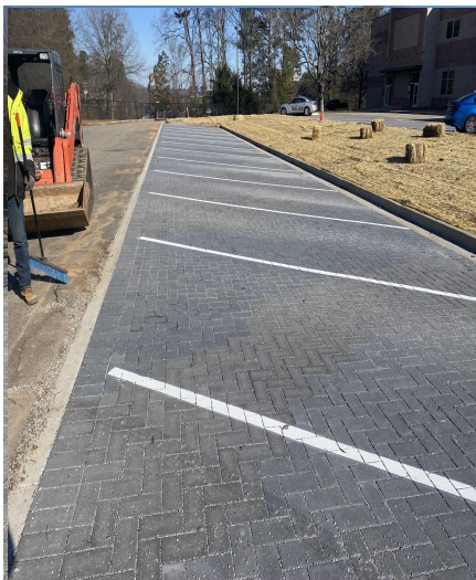
Striping in Phase 1 parking area completed.