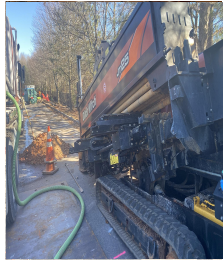
Georgia Power boring new primary service.